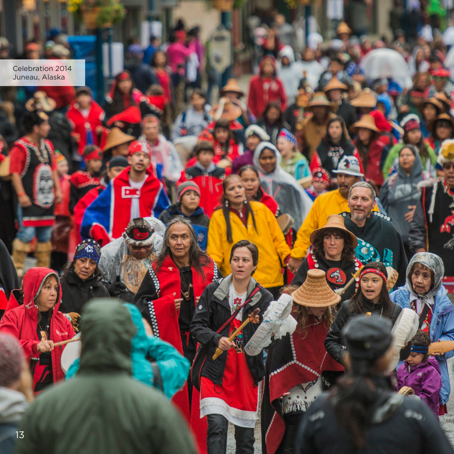
Celebration 2014 Juneau, Alaska