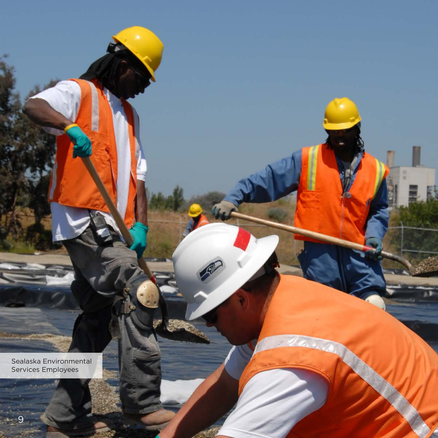
Sealaska Environmental Services Employees