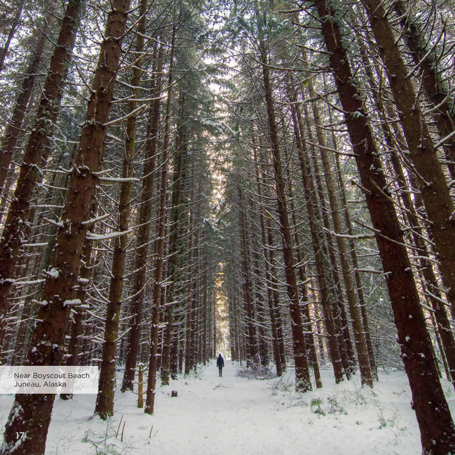
Near Boyscout Beach Juneau, Alaska