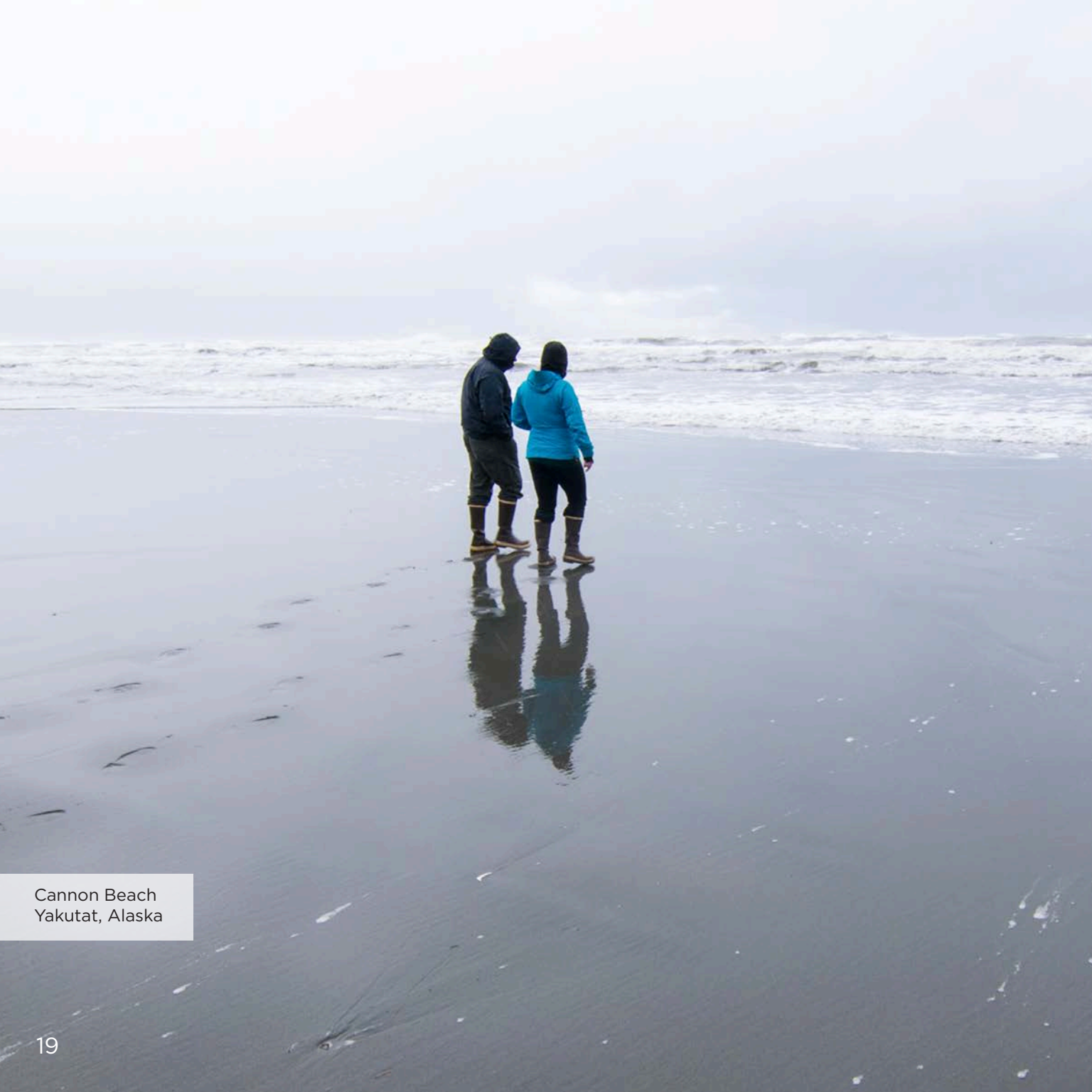
Cannon Beach Yakutat, Alaska