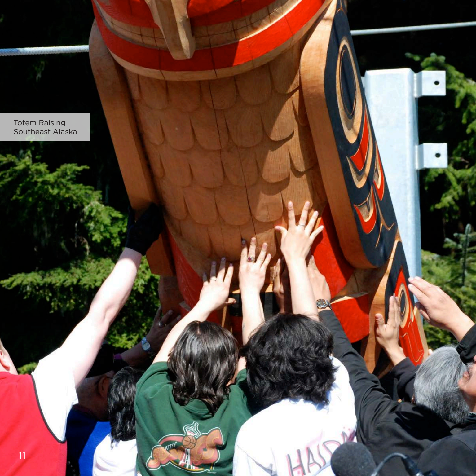
Totem Raising Southeast Alaska